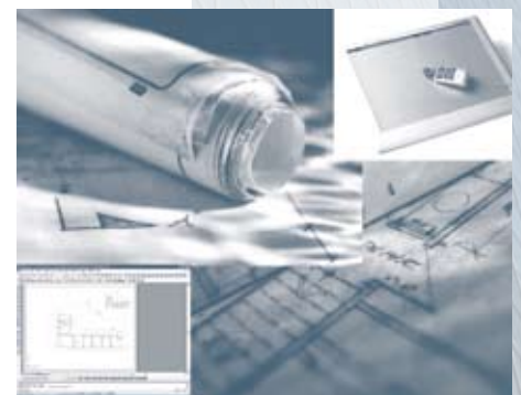
Supports measurement of hard copy drawings